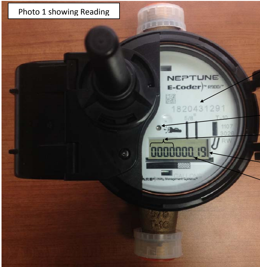
Photo 1 showing Reading